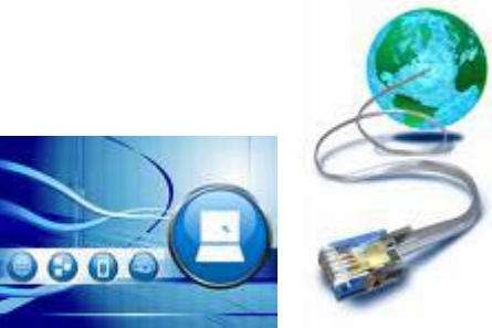
IT SERVICES & INTERNET PROVIDER