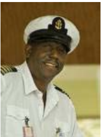
DOCKAGE/ HARBOUR MASTER/ YACHT CLUB