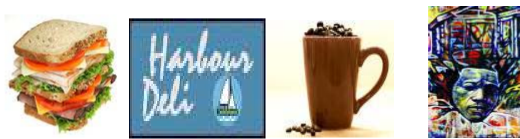
HARBOUR DELI & COFFEE SHOP/ ART GALLERY