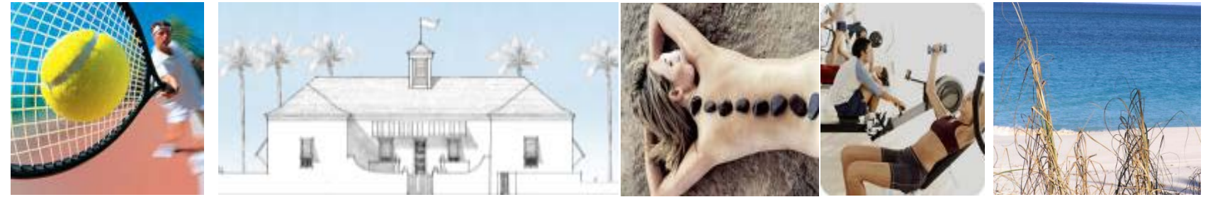
TENNIS CENTER/ BEACH CLUB/ SPA & WELLENESS/ GYM

BAY STREET – HARBOURFRONT MIX-USE NEIGHBOURHOOD – WEST END OF SCHOONER HARBOUR – PEDESTRIAN, BOAT & GOLF CART ACCESSIBLE – CATERS TO VILLAGE LIFE AND ALL VISITORS ALIKE