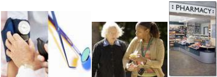
MEDICAL FACILITY/ ASSISTED IN-HOME LIVING/ PHARMACY