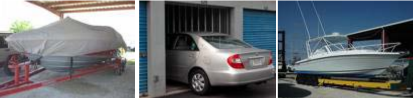
BOAT HAULING & CAR/ STORAGE/ SERVICING