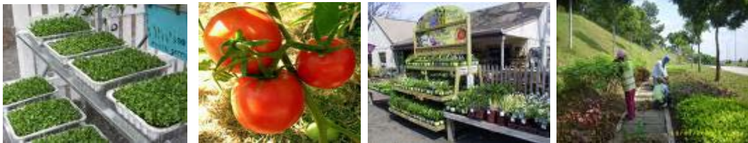
MICRO FARMS & ALLOTMENTS/ GARDEN CENTER/ LANDSCAPE MAINTENANCE