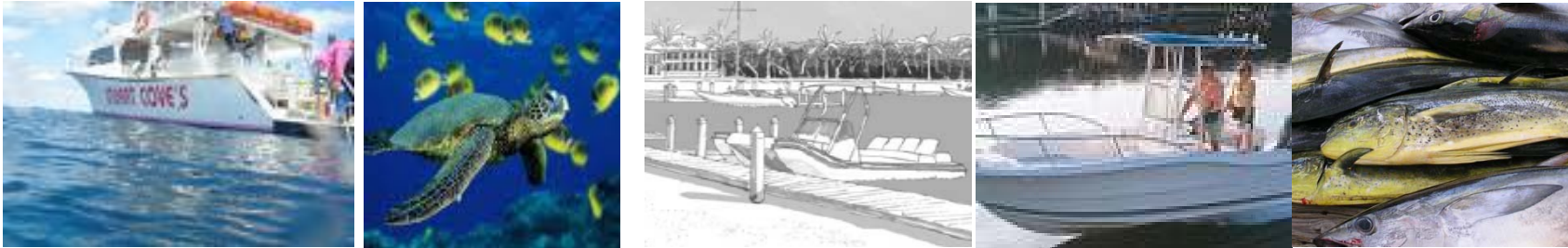
DIVE & SNORKEL CENTRE/ BOAT & SLIP RENTAL/ OFFSHORE SPORTS FISHING