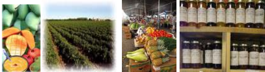
FOOD PROCESSING/ COOPERATIVES/ FARMERS MARKET/ LOCAL BRANDS