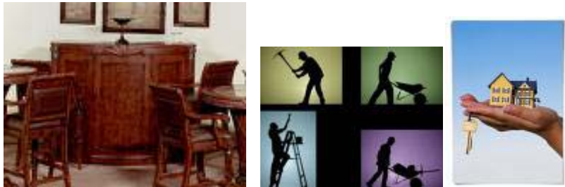
FURNITURE STORE/ PROPERTY MAINTENANCE & MANAGEMENT