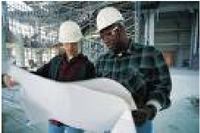
CIVIL ENGINEERING/ ARCHITECTURAL / DESIGN & PROJECT MANAGEMENT SERVICES