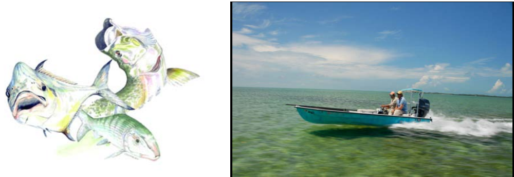
BLACK FLY BONEFISH CLUB AT SCHOONER BAY

BAY STREET – HARBOURFRONT MIX-USE NEIGHBOURHOOD – WEST END OF SCHOONER HARBOUR – PEDESTRIAN, BOAT & GOLF CART ACCESSIBLE – CATERS TO VILLAGE LIFE AND ALL VISITORS ALIKE