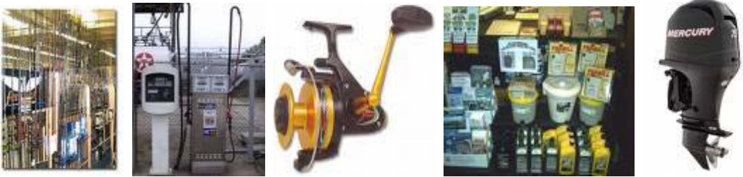
SHIP'S STORE/ BAIT & TACKLE/ FUEL/ MARINE SUPPLY & SERVICING