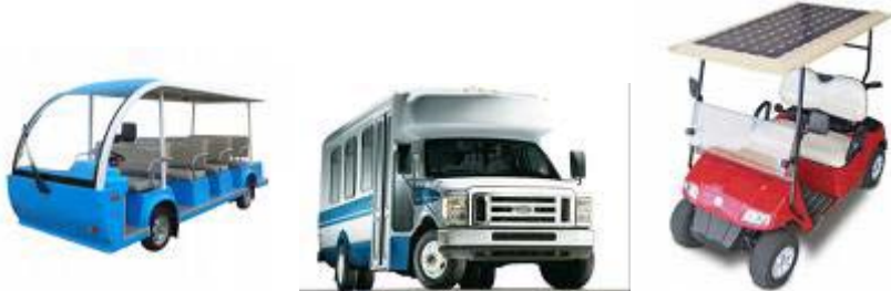
SHUTTLE & BUS TRANSPORTATION/GOLF CART RENTAL & SERVICE