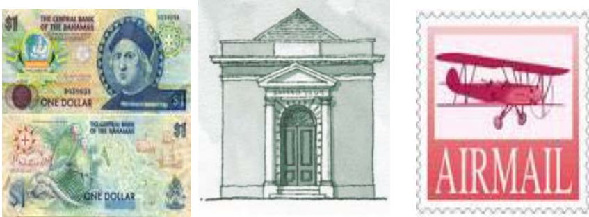
BANKING/POST OFFICE & INTL COURIER SERVICES