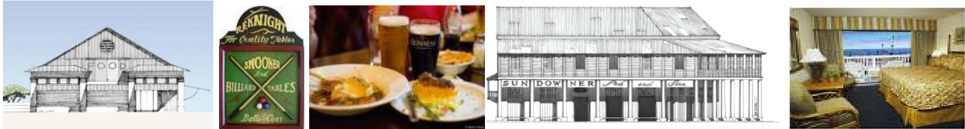
REGIONAL FOOD STORE/ PUB & INN